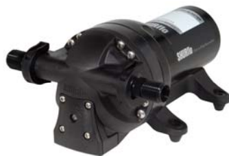
SA13044/46 - 5000 Extreme