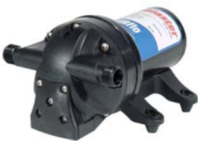
SA14203 - 4000 Extreme

The EXTREME wash down pumps delivers high flow and pressure, giving you the ultimate in washdown capabilities. These high volume pumps will clean your deck quickly and easily. The corrosion resistant seamless motor shell with sealed switch provides excellent protection against the harsh marine environment. The EXTREME 4000 and 5000 series are designed for the toughest washdown applications. Thermally protected. Ignition protected. 3 YEAR WARRANTY.