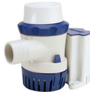
*Float Switch Sold Separately

Smart. Reliable. Attractive. Efficient. Everything you are looking for in a bilge pump. Our tough, high density nylon and heavy duty water cooled motor gives the SHURflo bilge pumps unparalleled reliability. Installations are a snap with our unique swivel base plate and extended 6" tinned wire and assembly. Easy installation and removable cartridge for easy cleaning. 3 YEAR WARRANTY. Available for OEMs only.